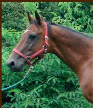
Dunawa xx a mother of the outstanding steeple-chase horse, Duce