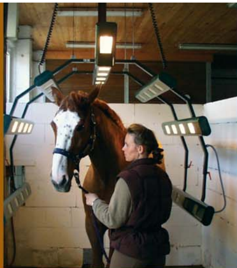
Horse solaria from RAINBOW