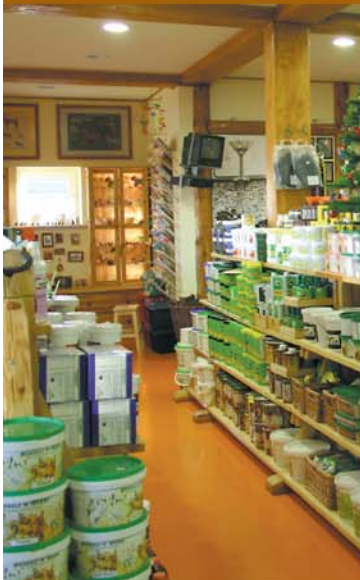
Shopping area Department