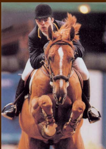
Baloubet du Rouet SF