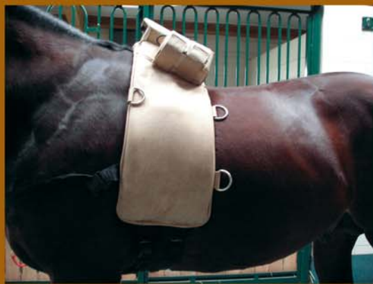
Horse massagers from EQUISSAGE