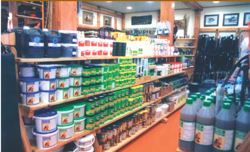
The shop - supporting products department