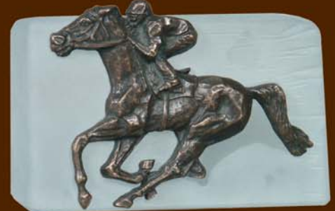
Michał Siemiński Bronze relief on the glass - 18 x 12 cm