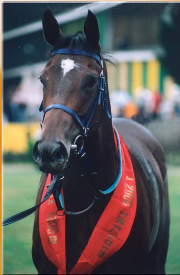
Księżna Walli xx - out of the outstanding mare, Księżna Knieji