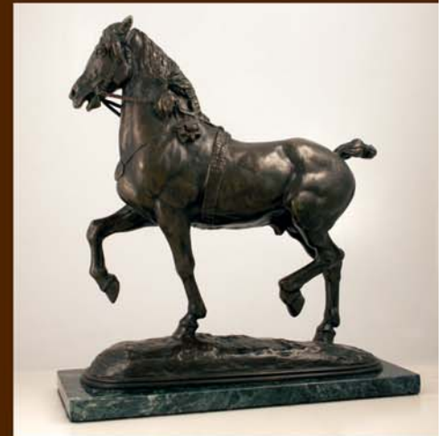
Emanuel Fremiet (1824-1910) 'Percheron medallist stallion', bronze, about 1860, signed - base: 10.5 x 32.5 cm, height 39.5 cm