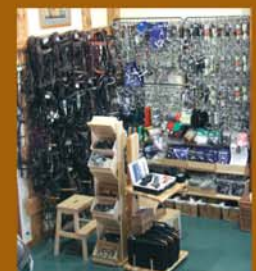
Bridles and snaffle bits