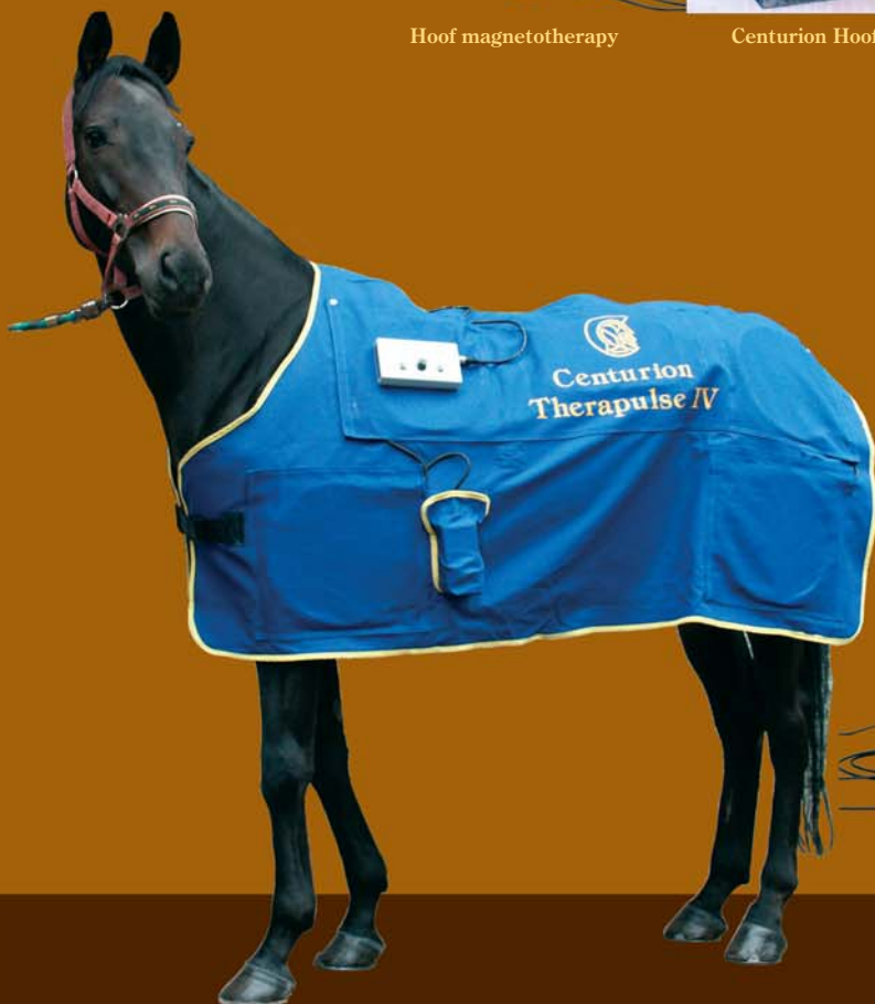
Centurion 4 PH

They are used to expose sports horses and racehorses to infrared radiation that supports development of red blood cells, improves metabolism and musculature.