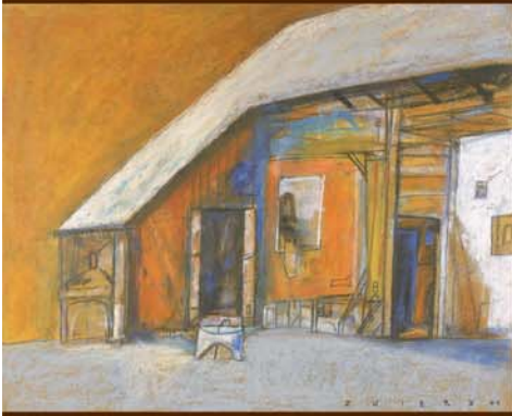
Sławomir Zwierz oil pastels / paper - 35 x 44 cm