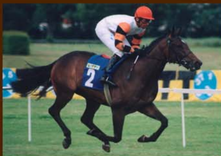
Księżna Walii xx a daughter of the outstanding mare, Księżna Knieji