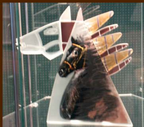
Patrycja Dubiel - sculpture (glass) - Black Horse - height 27 cm