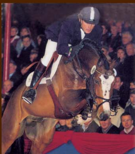
Balou du Rouet Old.