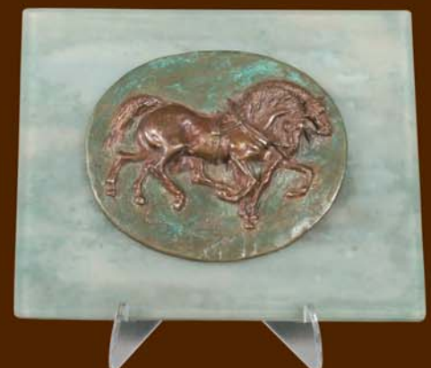
Anna Dębska Bronze relief on the glass plate - 29 x 24 cm