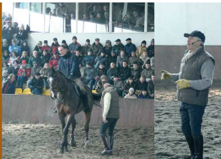
Nelson Pessoa conducts training - Warsaw 2006