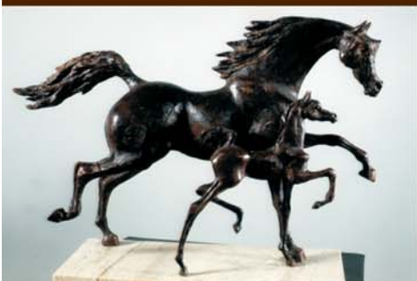
Anna Dębska sculpture, bronze - height 25 cm