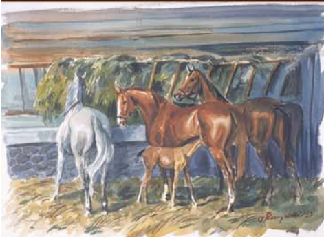
Jacek Reczyński watercolour on paper - 41 x 57.5 cm