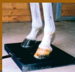
Centurion Hoof Pad

Our firm specializes in horse fitness restoration as well as in sports horses and racehorses supporting.